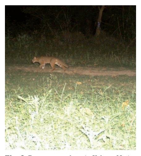
Fig. 3. Rusty-spotted cat in Kalesar National Park pictured on 23 April 2015.

KNPS is located in the eastern district of Yamunanagar, Haryana, at the juncture of four state boundaries: Uttar Pradesh, Uttarakhand, Haryana and Himachal Pradesh (Fig. 1). The river Yamuna flows through the eastern part of the forest, whereas the southern part has human settlements that put immense pressure and disturbance around