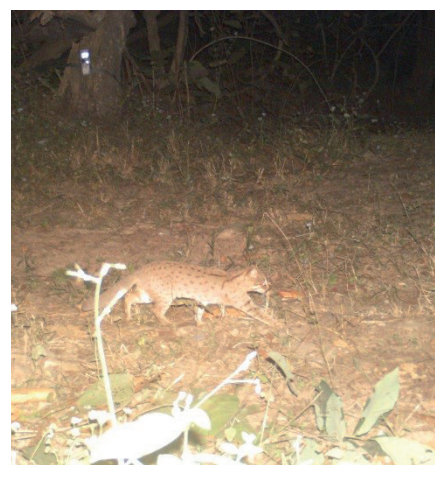
Fig. 2. Rusty-spotted cat in Kalesar National Park pictured on 12 December 2014.

Found throughout a wide habitat range from moist and dry deciduous forest types