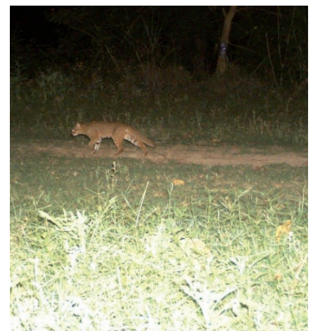
Fig. 3. Rusty-spotted cat in Kalesar National Park pictured on 23 April 2015.

KNPS is located in the eastern district of Yamunanagar, Haryana, at the juncture of four state boundaries: Uttar Pradesh, Uttarakhand, Haryana and Himachal Pradesh (Fig. 1). The river Yamuna flows through the eastern part of the forest, whereas the southern part has human settlements that put immense pressure and disturbance around