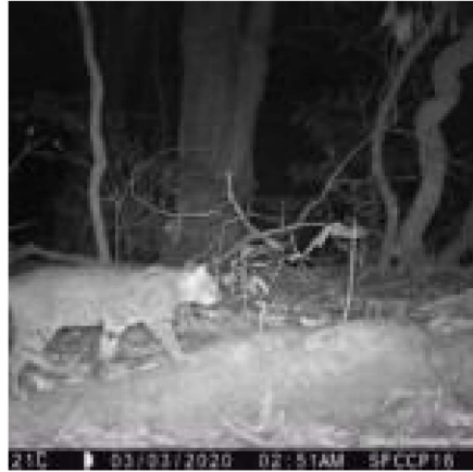
A CAMERA-TRAPPED PHOTO OF A RUSTY-SPOTTED CAT IN DUNUMADALAWA FOREST RESERVE IN CENTRAL SRI LANKA